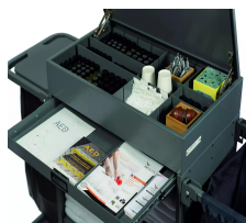
T-P Stationery drawer.