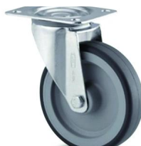
R-E 2 fixed and 2 swivel wheels.