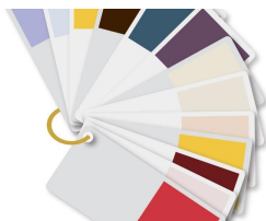
COLLAR Choice of colors. * from 10 pieces or mini 10 carts