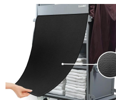
RID Hide curtain in black leatherette.