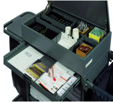
T-P Stationery drawer.