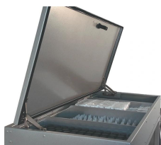
C-125 Cover for b-125.