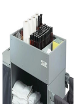
B-125 Bac produits d'accueil 125mm.