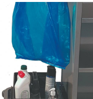
P-E Basket for cleaning products.