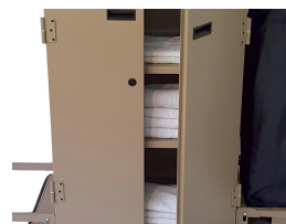
P Lockable doors