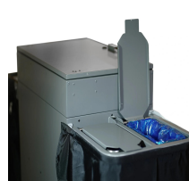
STS 2 garbage can liners for waste separation.