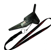
EC-P Ergo-Door wedge.