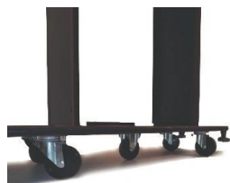
5-R 5th wheel for size 750-850.