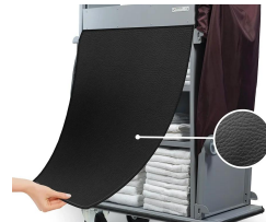
RID Hide curtain in black leatherette.