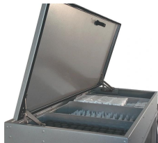
C-125 Cover for b-125.