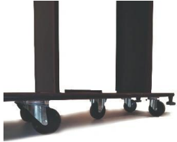
5-R 5th wheel for size 750-850.