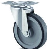
R-E 2 fixed and 2 swivel wheels.