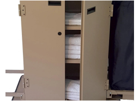
P Lockable doors