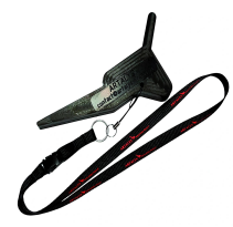
EC-P Ergo-Door wedge.