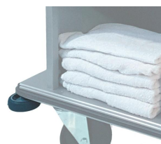
P-C Corner bumpers.