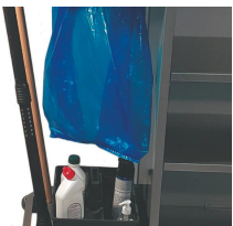
C-B Broom clip.