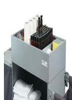
B-125 Bac produits d'accueil 125mm.