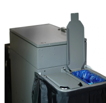
STS 2 garbage can liners for waste separation.