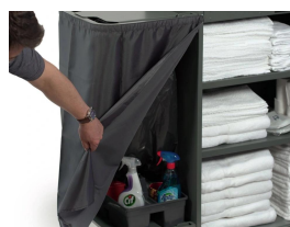
S-C Cover bag for garbage bag.