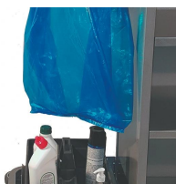
P-E Basket for cleaning products.